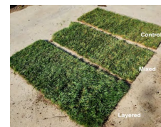
Sod with engineered soil