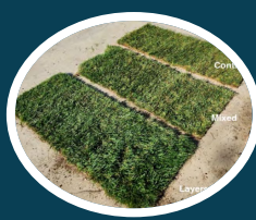
Sod with engineered soil